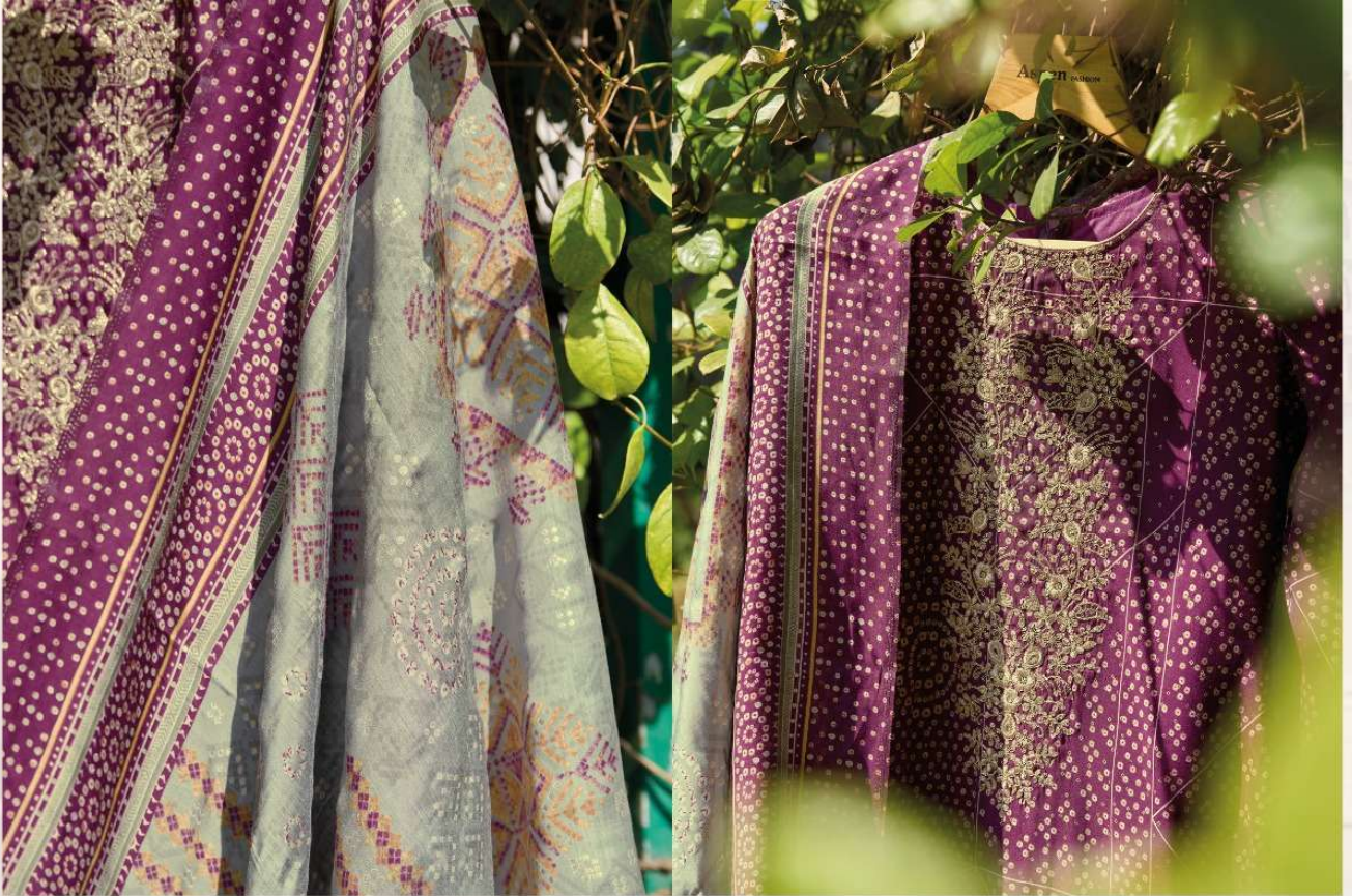
Bandhani or Bandhej is generally made up of natural colors.