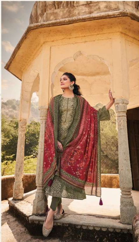
Elements ELEMENTS 542