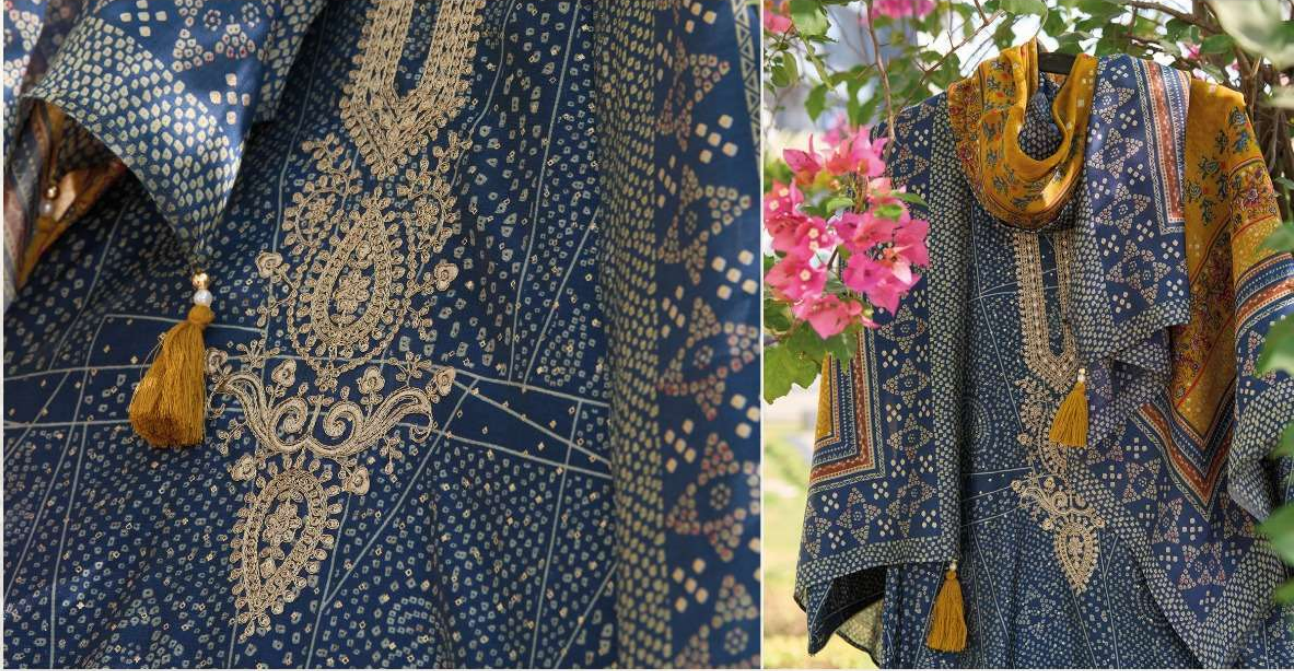
Bandhani products have their own specific meanings in different communities in India.