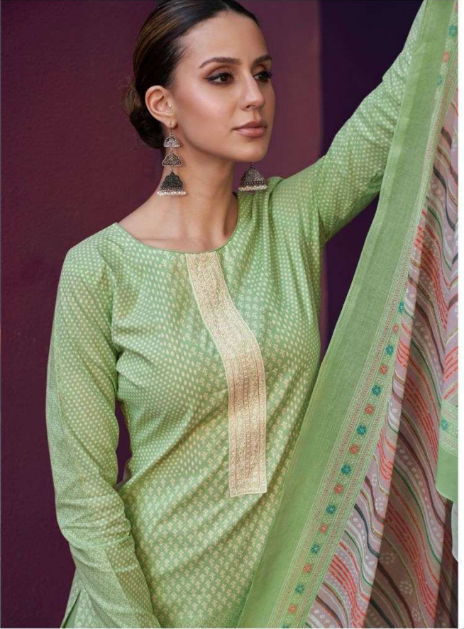
By the patterns & vibrant colors of poisonous yet beautiful creature S