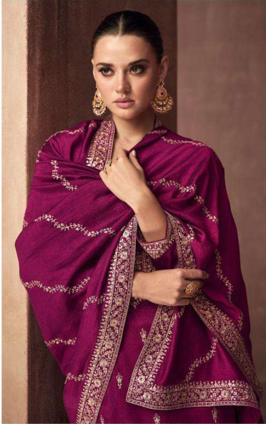
A - 9582