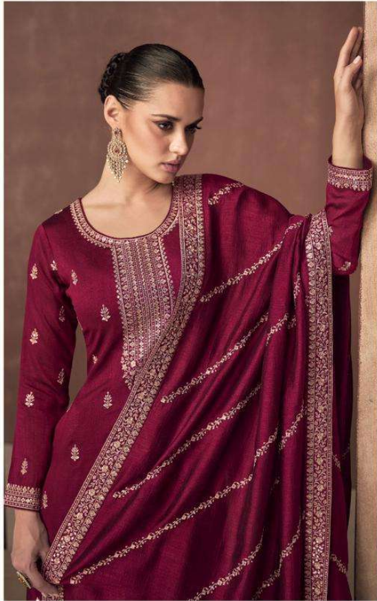
A - 9586