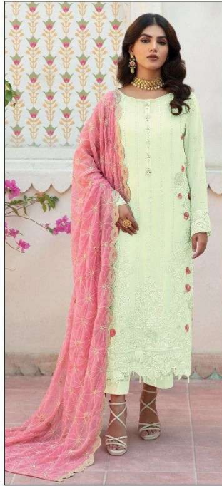
S - 128 C