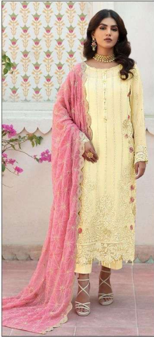
S - 128 A