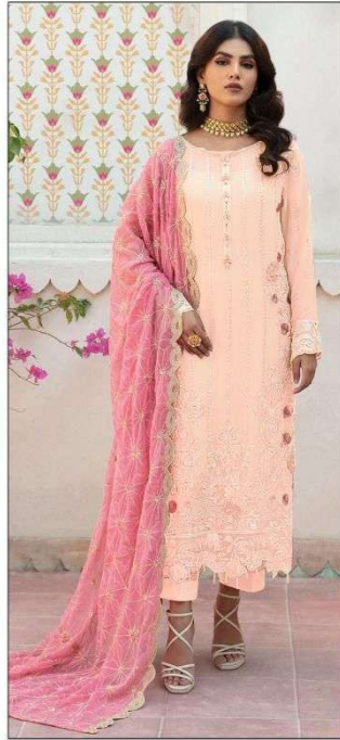
S - 128 B