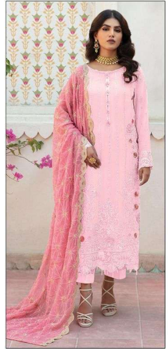
S - 128 D