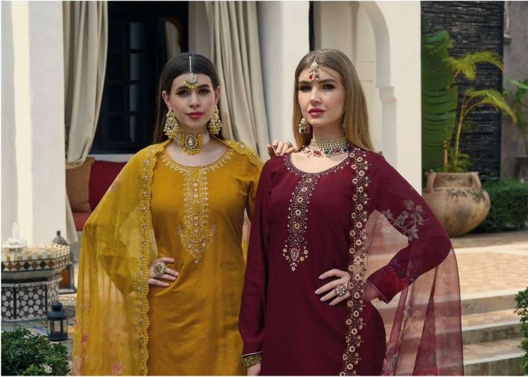
A CLASSIC ACCESSORY THAT NEVER GOES OUT OF FASHION