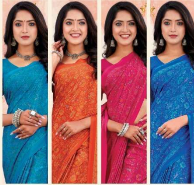
2101 A 2101 B 2101 C 2101 D