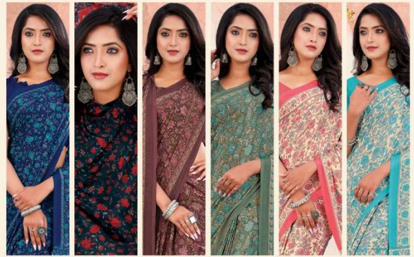
2106 A 2106 B 2107 A 2107 B 2108 A 2108 B