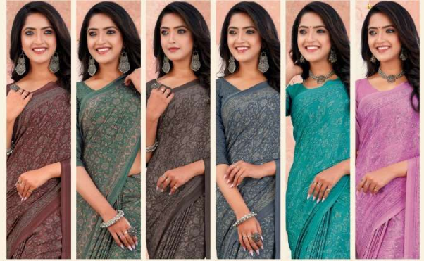
2102 A 2102 B 2102 C 2102 D 2103 A 2103 B