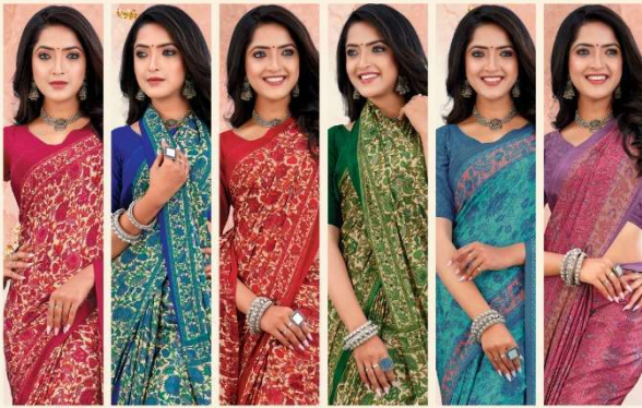
2104 A 2104 B 2104 C 2104 D 2105 A 2105 B