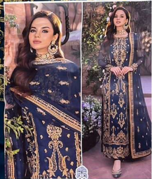
KHUSHBU Vol-4 ZAHA D.No.10135 TOP Faux Georgette with Embroidery BOTTOM-INT DUPATTA Nazlin with Embroidery