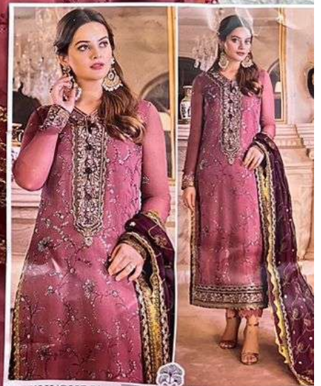
KHUSHBU Vol-4 ZAHA D.No. 10134 TOP Faux Georgette with Embroidery BOTTOM-INNER Chiffon with Embroidery DUPATTA Net with Embroidery