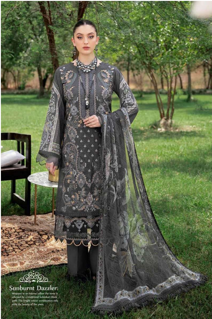
Sunburnt Dazzler: Wrapped in an intense yellow the kurta is adorned by a traditional Lumbani block print. The bright color combination only adds the beauty of the piece.