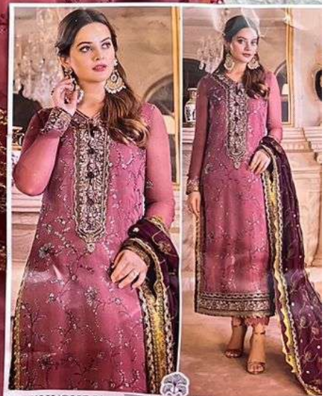
KHUSHBU Vol-4 ZAHA D.No. 10134 TOP Faux Georgette with Embroidery BOTTOM INNER Dual sambhoos DUPATTA Netting with Embroidery