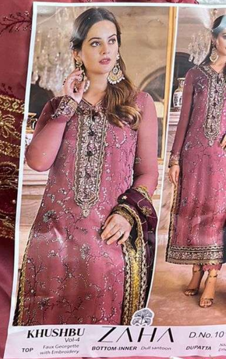
KHUSHBU Vol-4 TOP Faux Georgette with Embroidery ZAHA D.No. 10 BOTTOM-INNER Dull santoon DUPATTA NA Emb