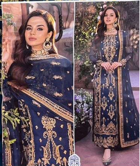
KHUSHBU Vol-4 ZAHA D.No.10135 TOP Faux Georgette with Embroidery BOTTOM-INT DUPATTA Nardin with Embroidery