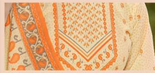
SR-16 There is beauty in a woman whose confidence comes from experience