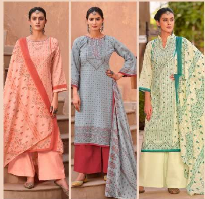
SR-18 SR-19 SR-20

Levisha® ਸਾਰਾ SARA • COTTON DUPATTA COLLECTION •