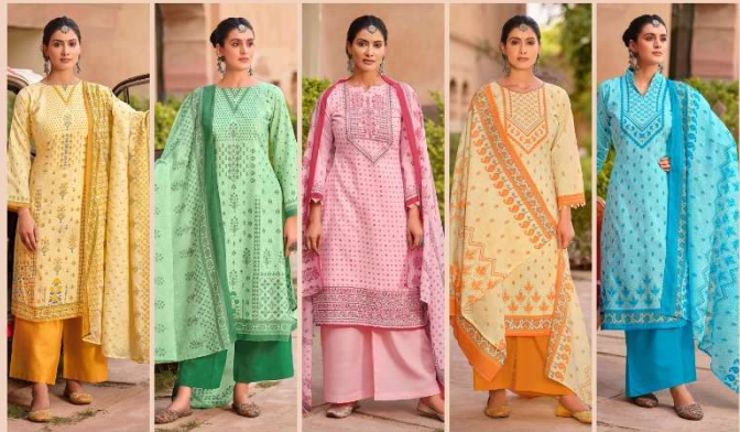
SR-13 SR-14 SR-15 SR-16 SR-17