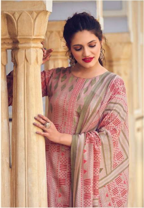
• DISTINGUISHING Style •