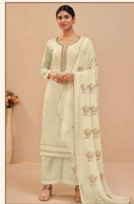
❁ 2046 D ❁