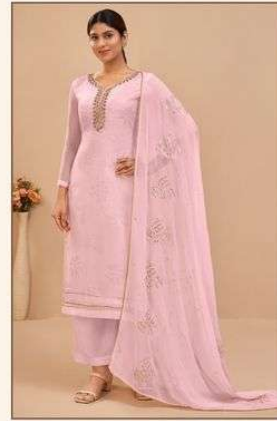
❁ 2045 C ❁