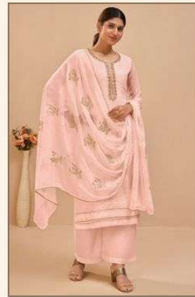
❁ 2046 B ❁