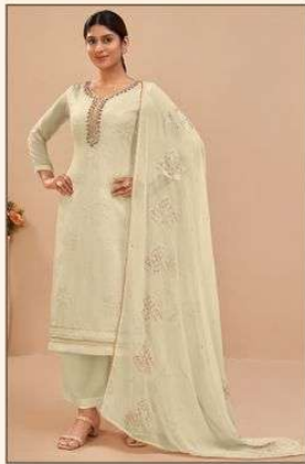
❁ 2045 D ❁