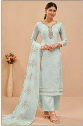
❁ 2045 A ❁