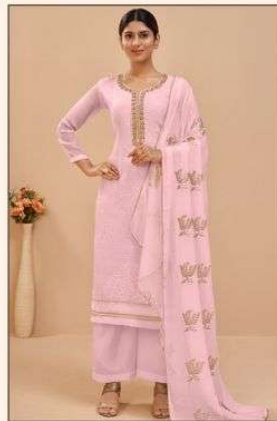
❁ 2046 C ❁