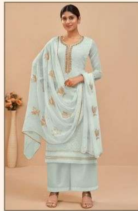
❁ 2046 A ❁