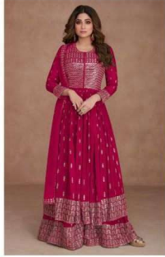
A | 9539