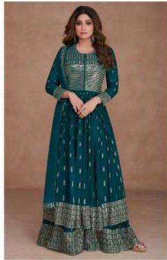
A | 9541