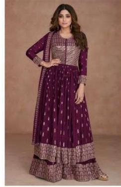
A | 9542