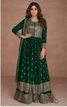
A | 9538