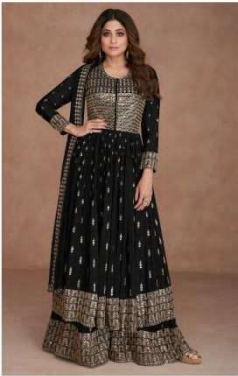
A | 9540