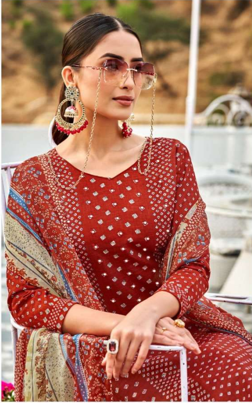
Celebrate your classy side with this perfect Collection of this printed designer style.