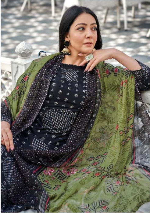
Celebrate your classy side with this perfect Collection of this printed designer style.