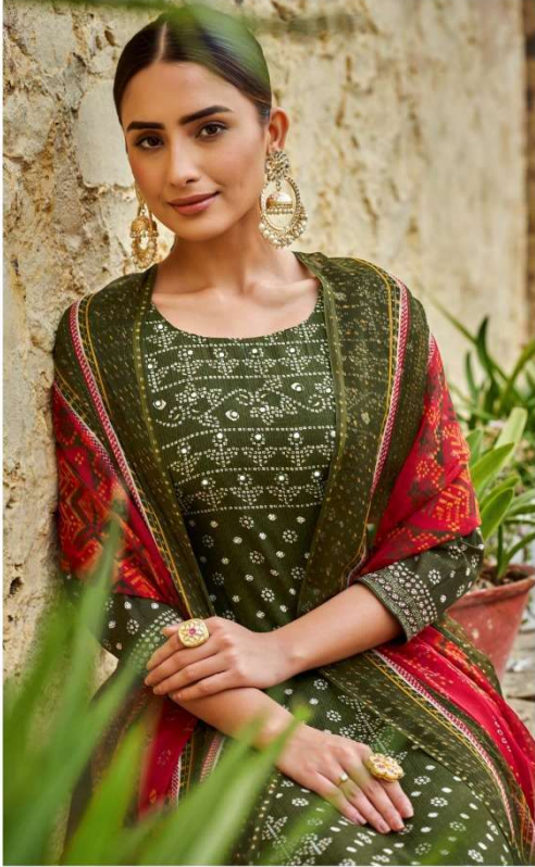
Celebrate your classy side with this perfect Collection of this printed designer style.