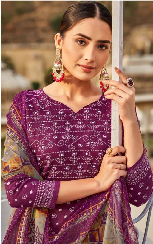
Celebrate your classy side with this perfect Collection of this printed designer style.