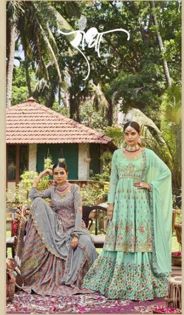
Look like royalty on your day in traditional yet modern attire with sparkling lovely stunning designs.