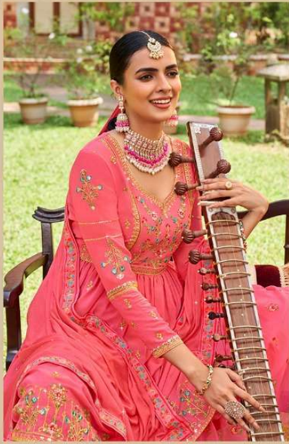
Being fashionista in you the outfit thats cool for any occasion in your life style.