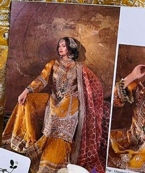
Top: Organza heavy emb Inner T/B: Heavy santoon Bottom: organza heavy et Dupatta: Organza heavy et