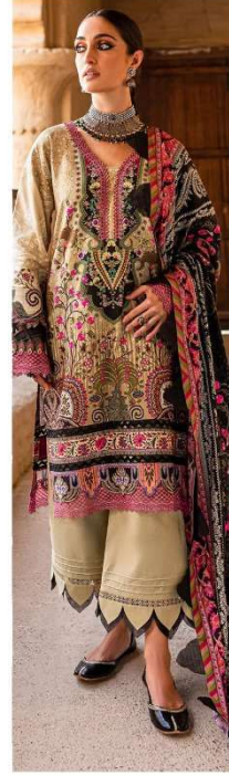
*** 7773 *** D.No.1047