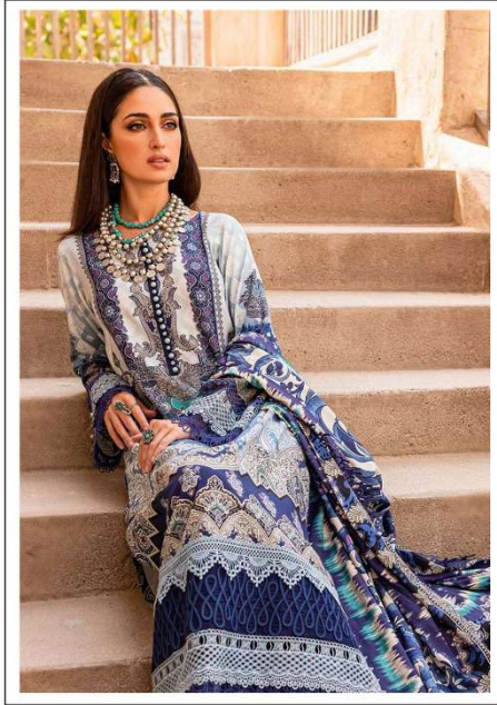
Firdose Vol - 11