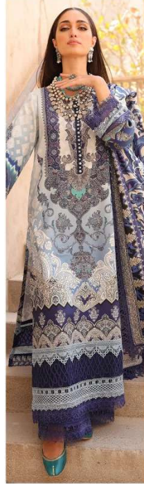
*** 7773 *** D.No.1046