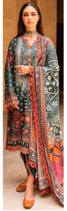
*** 7773 *** D.No.1048