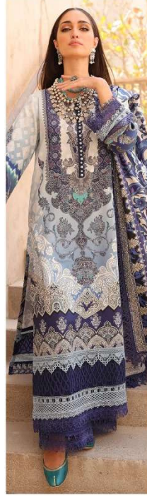
*** 7773 *** D.No.1046