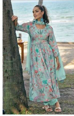
— 40046 —