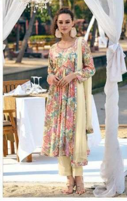
— 40042 —