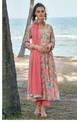
— 40045 —