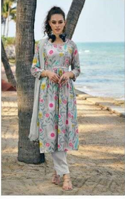
— 40041 —