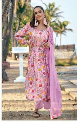
— 40044 —