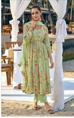
— 40043 —