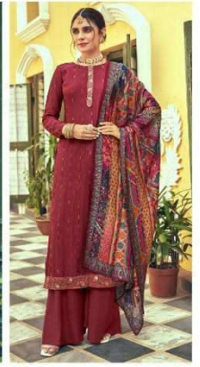
• | 47006 | •