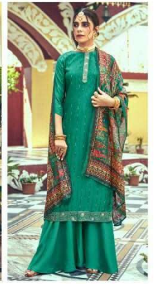
• | 47003 | •