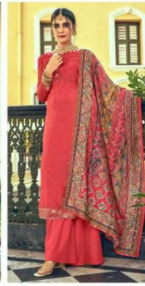
• | 47002 | •