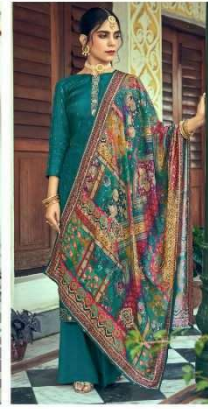
• | 47005 | •