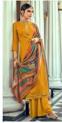
• | 47004 | •