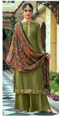
• | 47001 | •