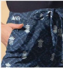
Both Side Pocket