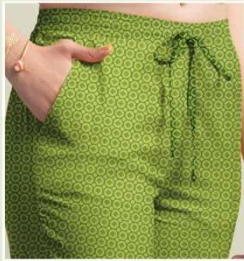
Both Side Pocket