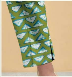
Slit in Bottom