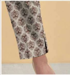
Slit in Bottom