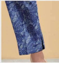
Slit in Bottom