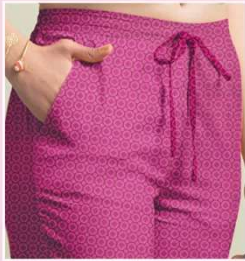
Both Side Pocket