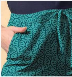
Both Side Pocket