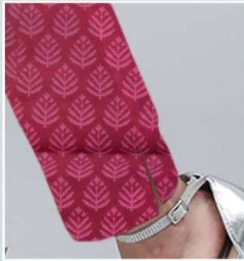
Slit in Bottom