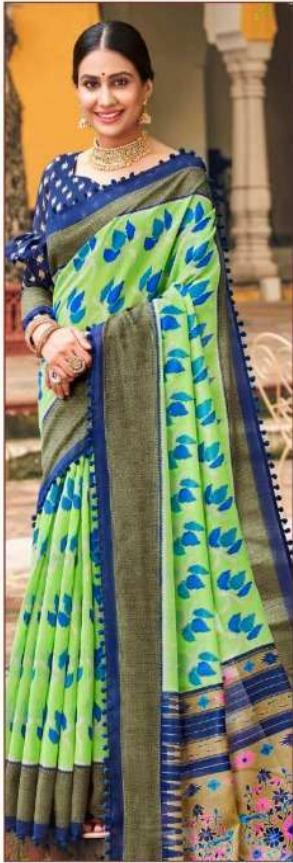
D.No.|| 40001 ||