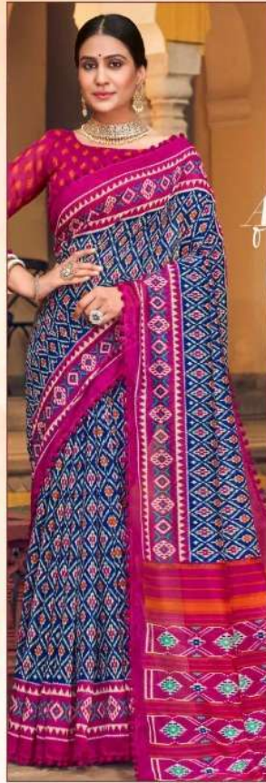
D.No.|| 40004 ||