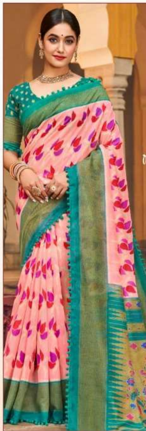
D.No.|| 40006 ||