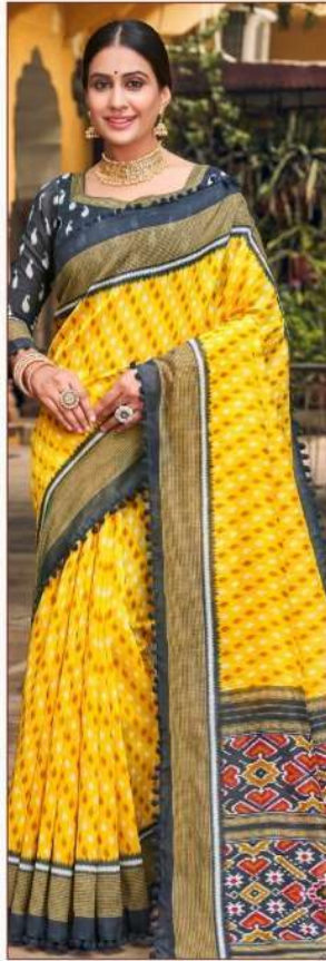
D.No.|| 40002 ||