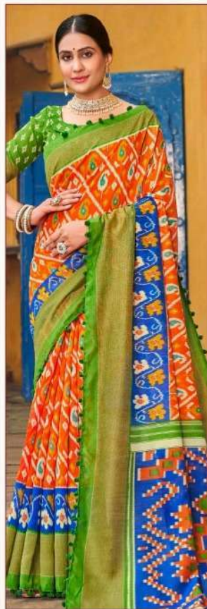
D.No.|| 40007 ||