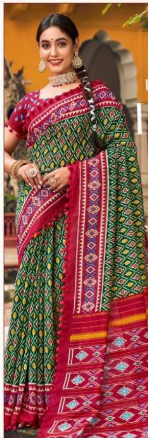
D.No.|| 40008 ||