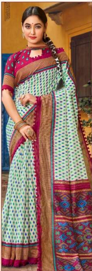
D.No.|| 40005 ||