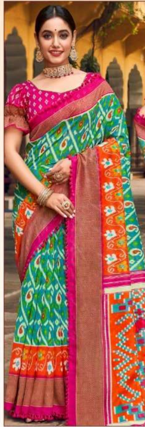
D.No.|| 40003 ||