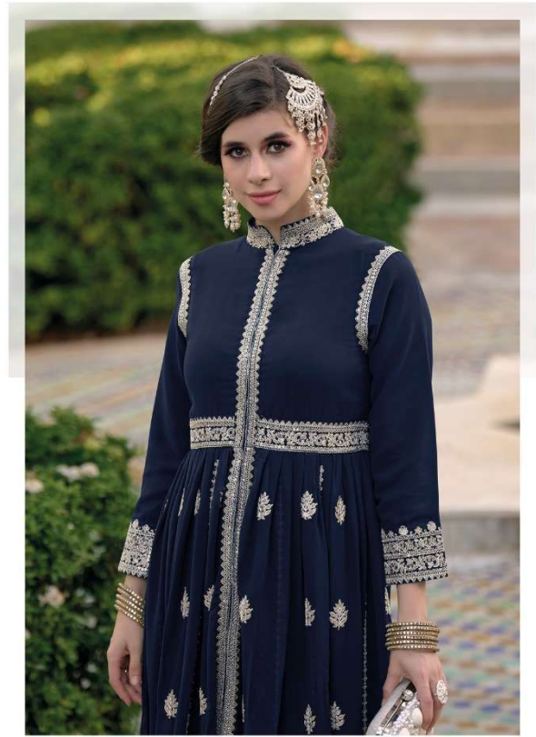
The difference between style and fashion is quality.