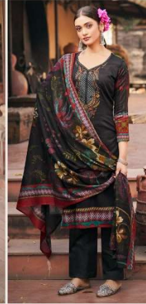
❁ ❁ ❁ 51005