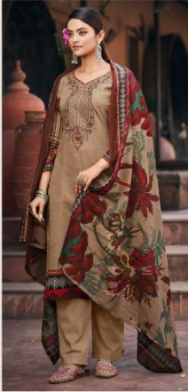
❁ ❁ ❁ 51001