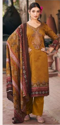
❁ ❁ ❁ 51004