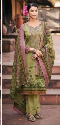
❁ ❁ ❁ 51003