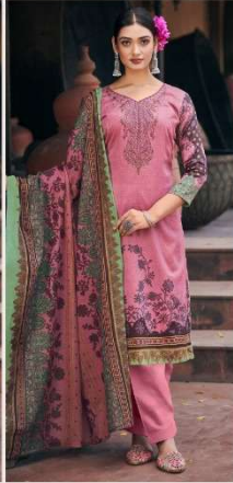
❁ ❁ ❁ 51002