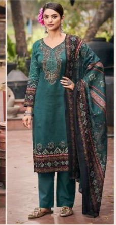
❁ ❁ ❁ 51006