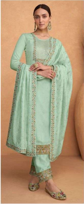
D.NO - 9500