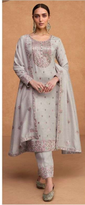
D.NO - 9501