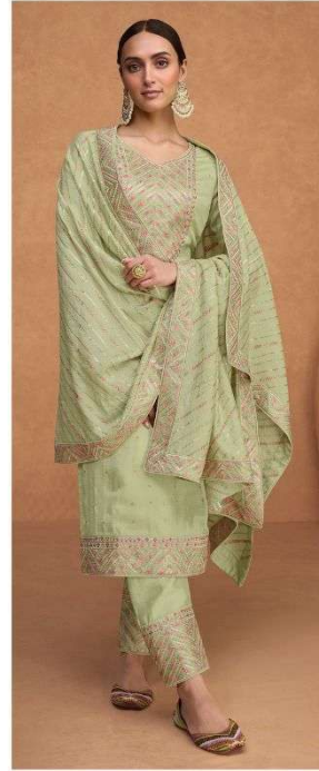
D.NO - 9502