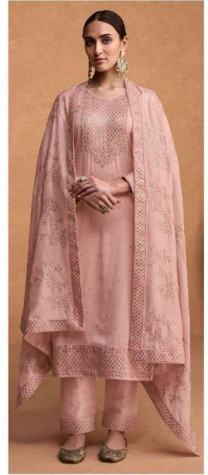
D.NO - 9503