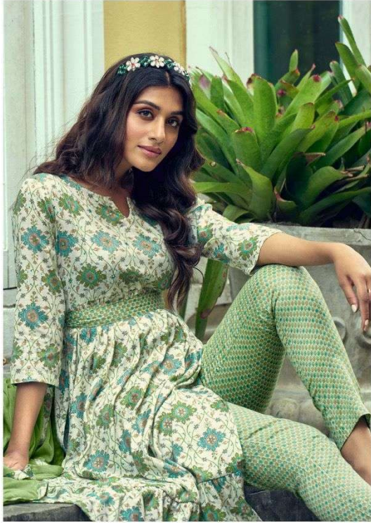
UPDATE PASTE STYLE