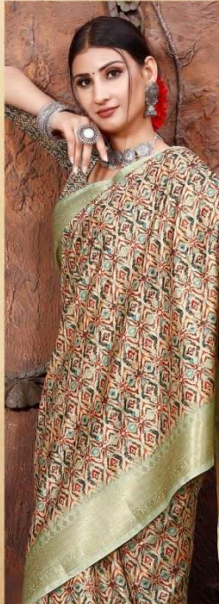
Fabrics which are designed to bring you great styles at absolutely irresistible prices.