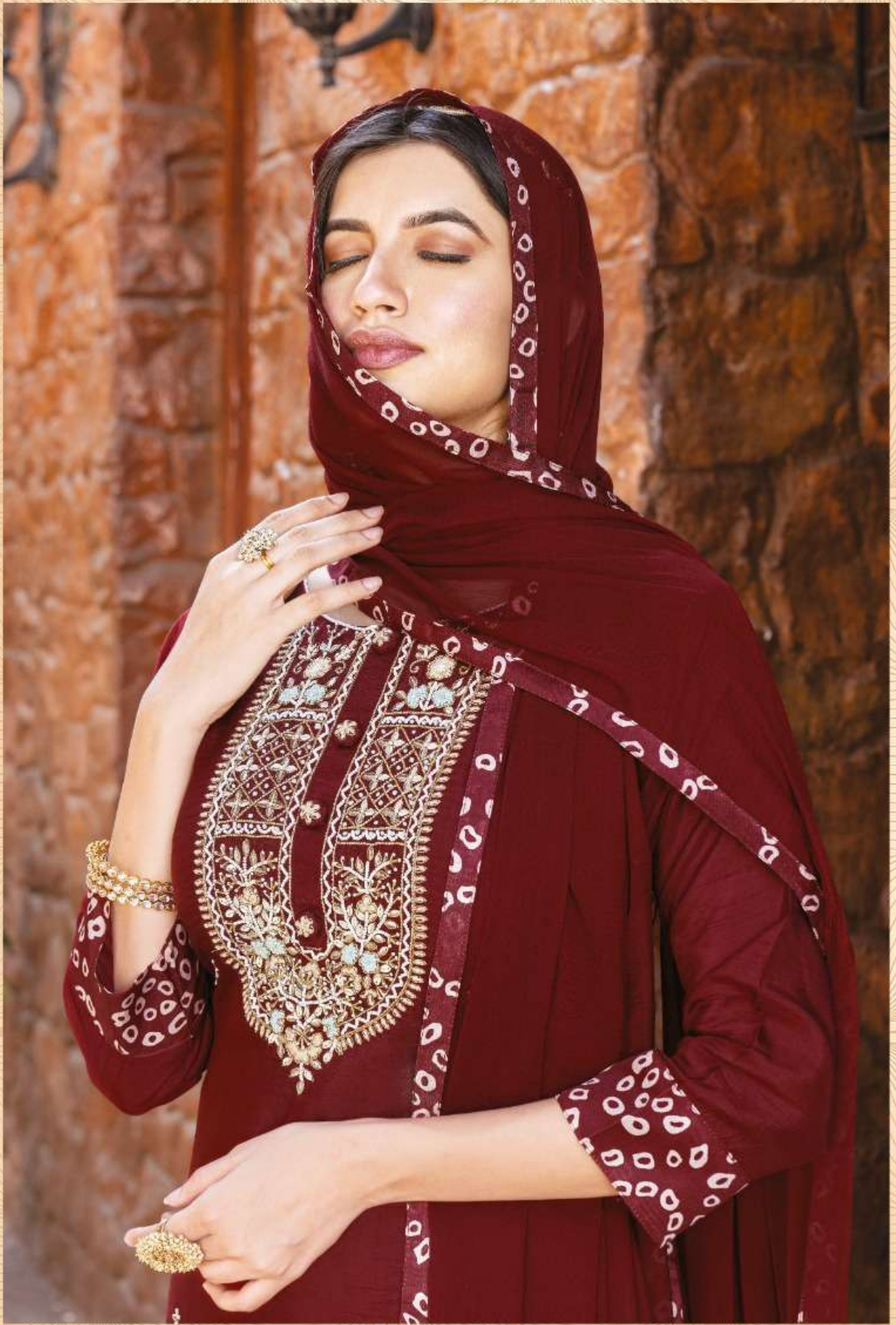
STYLE SUTRA | Profound willingness