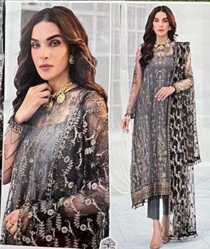
ZAHA D.No.10116 TOP: Butterfly Net with Heavy Embroidery BOTTOM: INNER: Dull satin DUPATTA: Butterfly Net with Heavy Embroidery