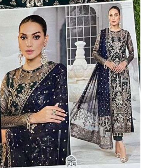
ZAHA D No. 10117 TOP Fox Georgette with Embroidery BOTTOM INNER [unclear]