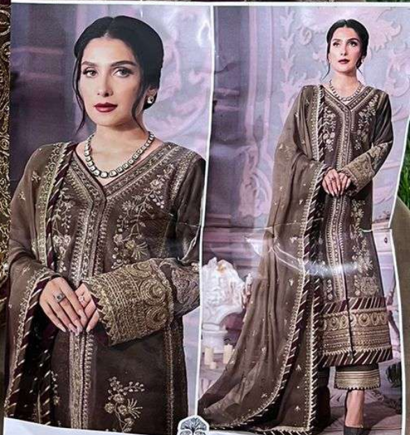
ZAHA D.No.10119 TOP Fox Georgette with Embroidery BOTTOM-INNER Dull santoon DUPATTA Nazmin Embroidery