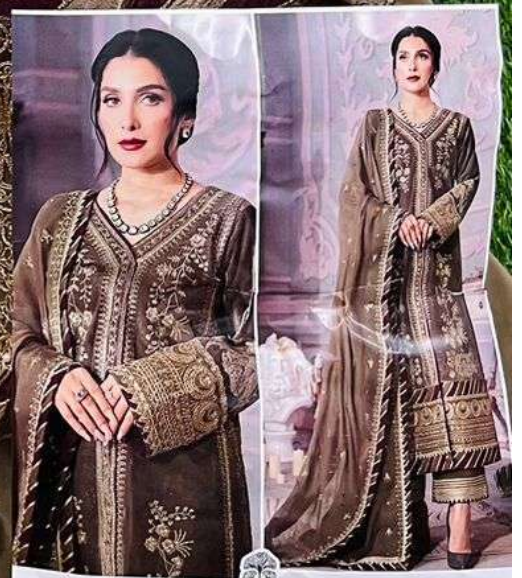
ZAHA D.No.10119 TOP Fox Georgette with Embroidery BOTTOM Quilt Lantoon DL