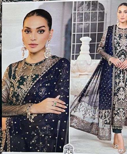
ZAHA D.No.10117 TOP Fox Georgette with Embroidery BOTTOM-INNER Dull santoc