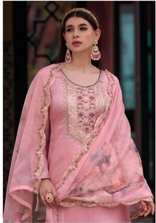
UPDATE PASTE STYLE 1539