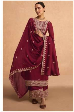
- 9494 -