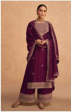
- 9489 -