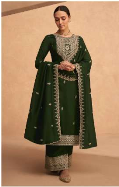
- 9491 -