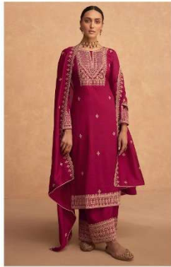
- 9492 -