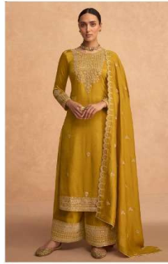
- 9493 -