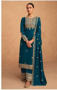
- 9490 -