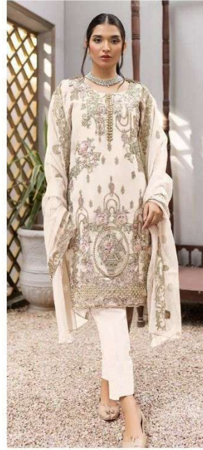
P - 10008-C