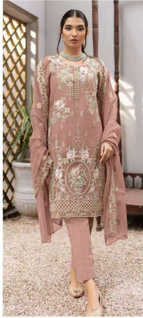
P - 10008-B