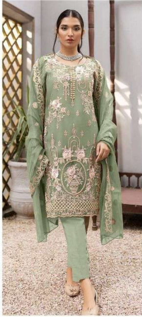
P - 10008-A