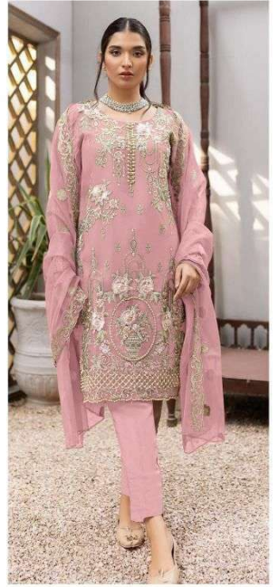
P - 10008-D