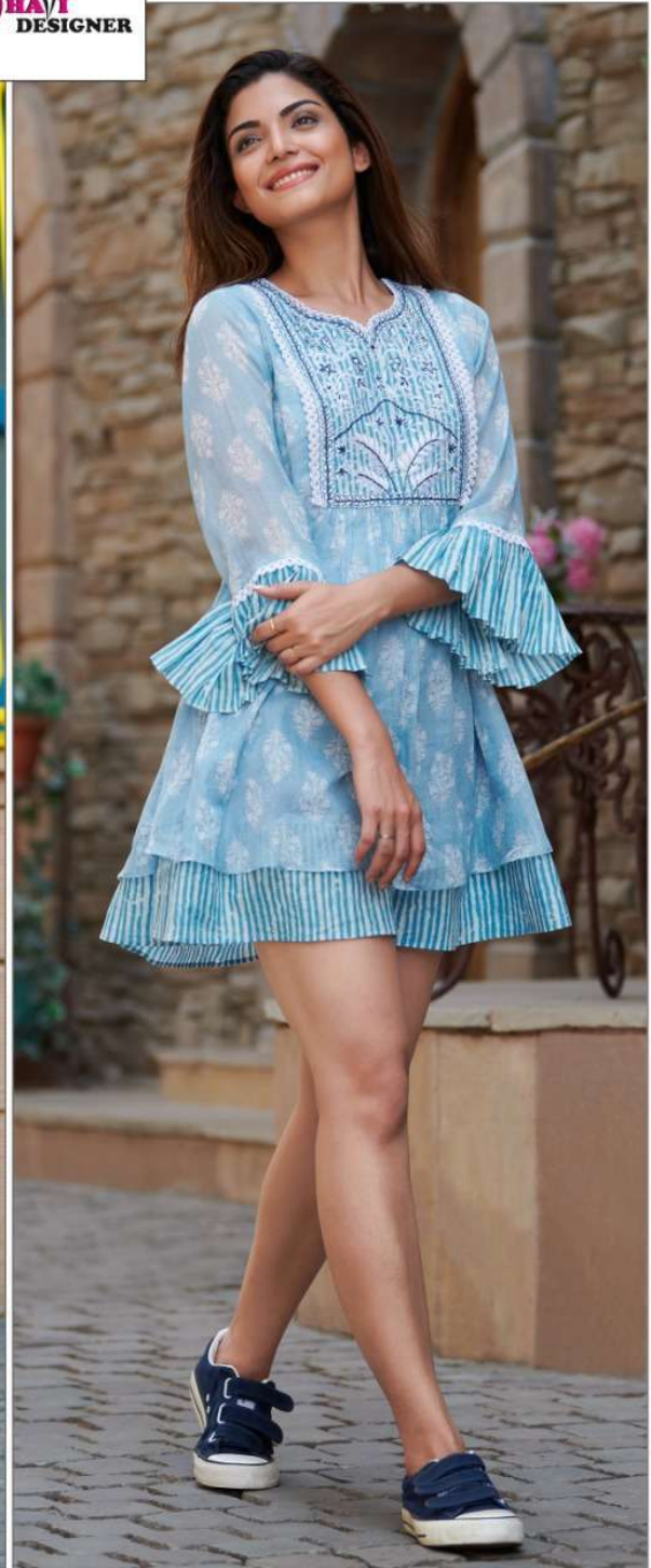
CODE - 004