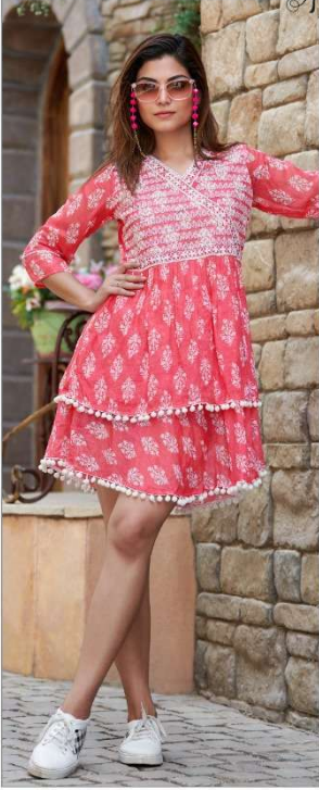
CODE - 001