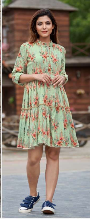
CODE - 002