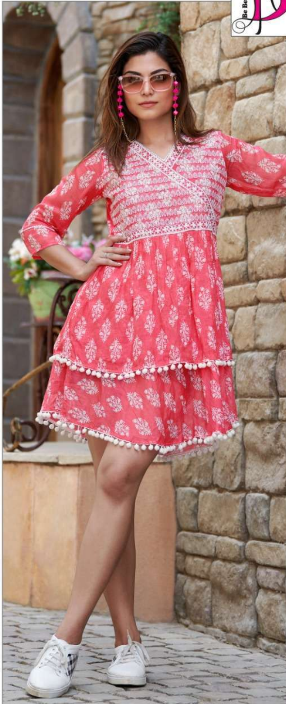
CODE - 001