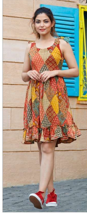
CODE - 003