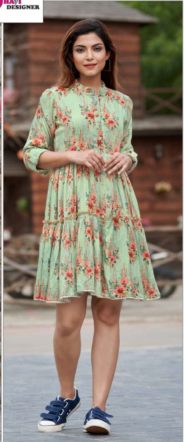
CODE - 002