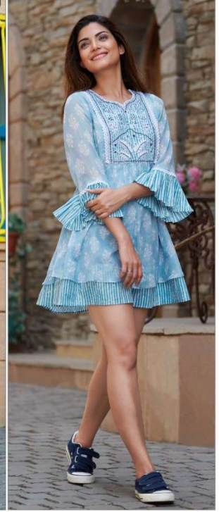
CODE - 004