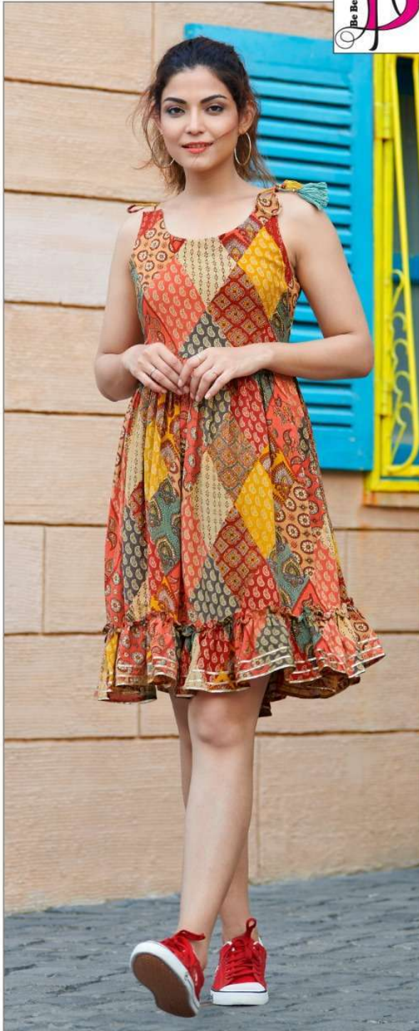
CODE - 003