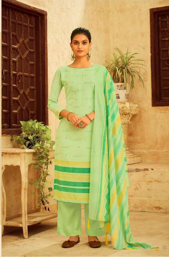
EXCLUSIVELY DESIGNER LOOK FOR THE FESTIVE SEASON 1003