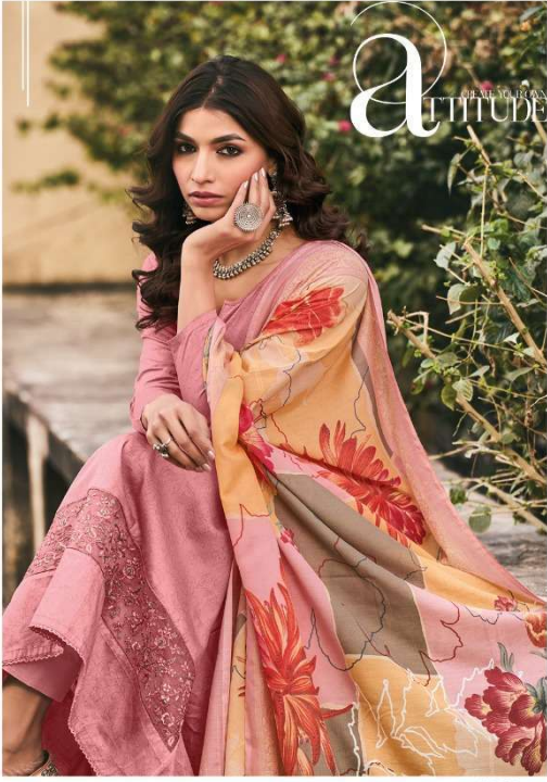
LOOK # 591