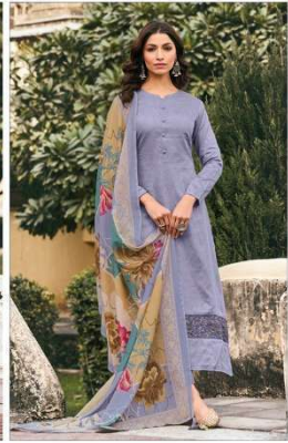
LOOK # 598