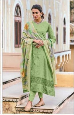
LOOK # 596