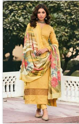
LOOK # 597