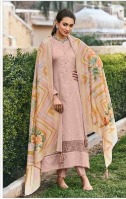
LOOK # 594