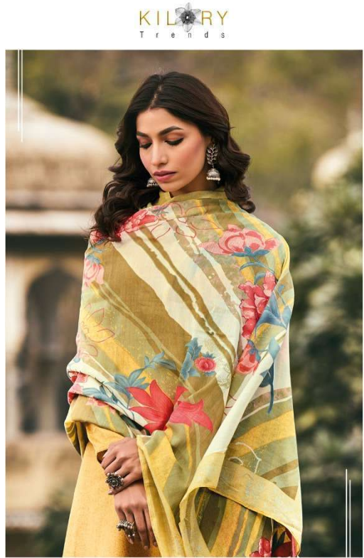
LOOK # 597