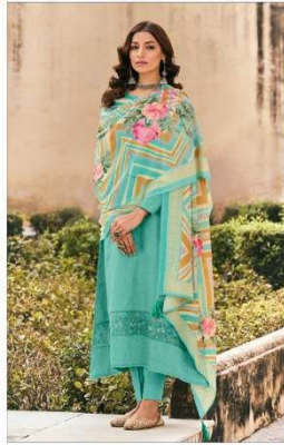
LOOK # 593