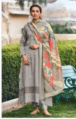
LOOK # 592