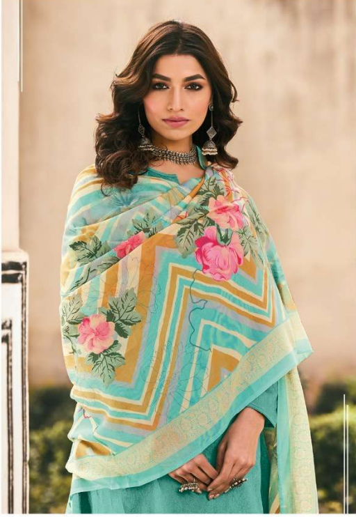
LOOK # 593