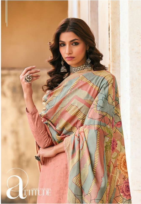
LOOK # 595