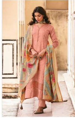
LOOK # 595