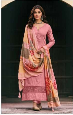
LOOK # 591