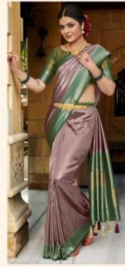
| 5111 |