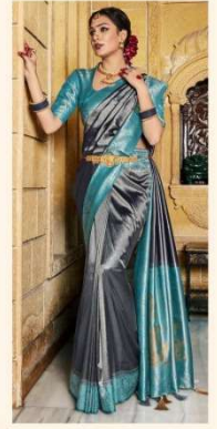
| 5106 |