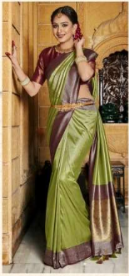
| 5108 |