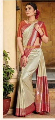
| 5104 |