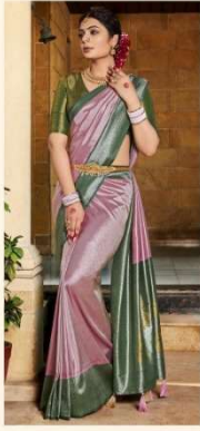
| 5103 |