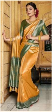
| 5107 |