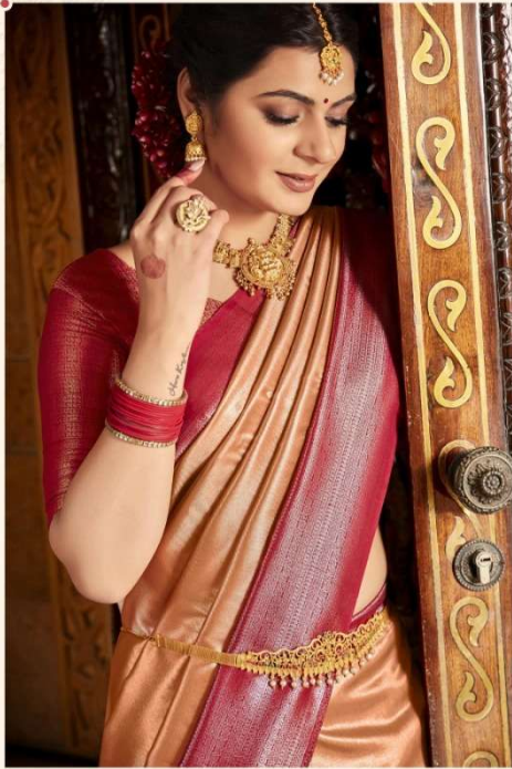
5101 move with the "trend" | HOW BEAUTIFUL IS THAT!