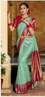
| 5109 |