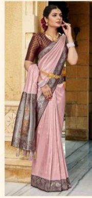
| 5100 |