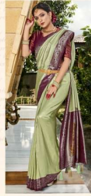
| 5105 |