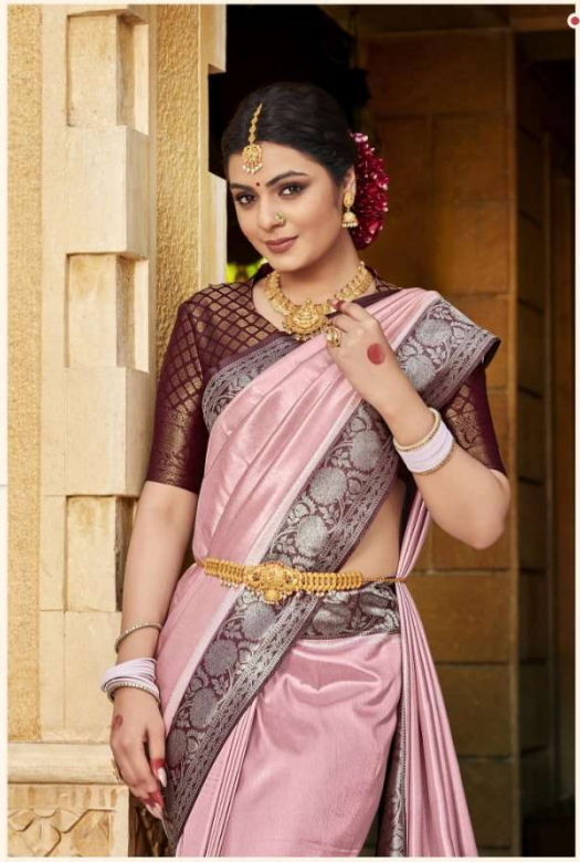
Full of tradition yet stylish | SMILE YOU'RE BEAUTIFUL