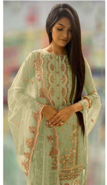
🔦 P - 10003-C