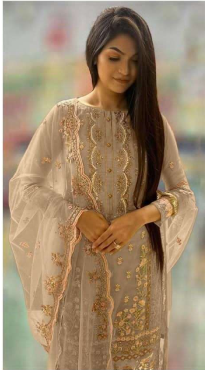
🔦 P - 10003-B