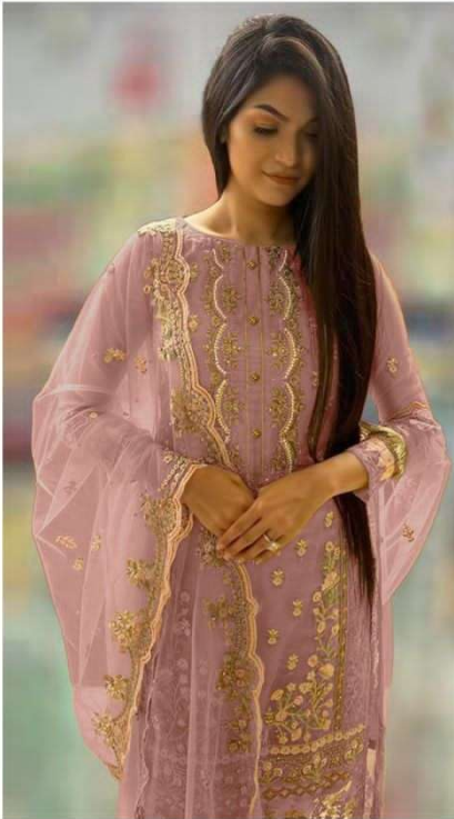
🔦 P - 10003-A