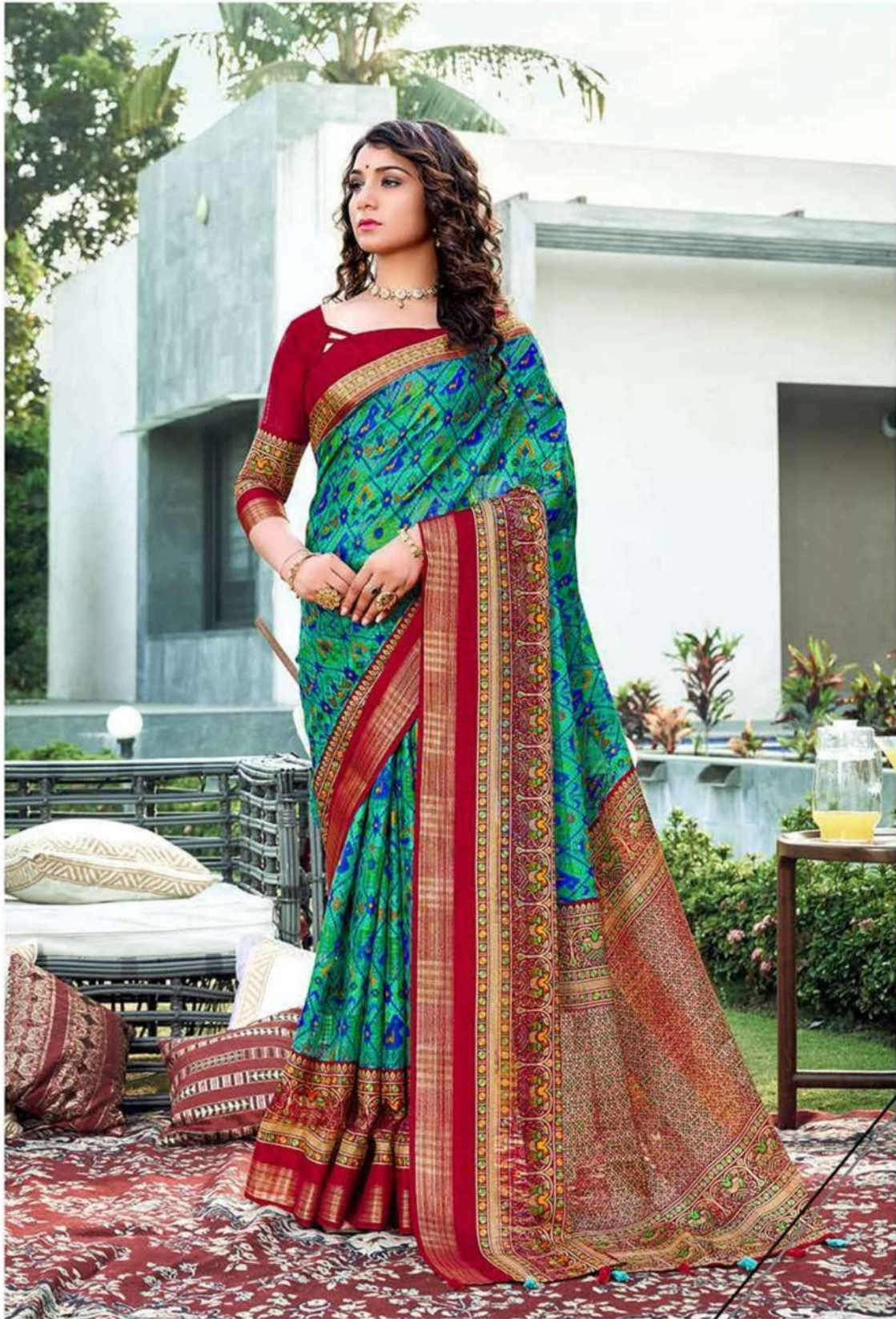
D.no. - 1904

With the world becoming a global village, with creative minds growing wider, with technology in the fashion industry growing manifold and with experimentation becoming the trend du jour, the Fashion world is witnessing an era of mix and match. Think designs infused with cultural, social and geographical diversities