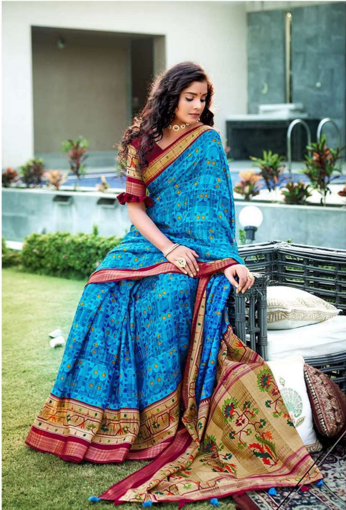
D.no. - 1906

With the world becoming a global village, with creative minds growing wider, with technology in the fashion industry growing manifold and with experimentation becoming the trend du jour, the Fashion world is witnessing an era of mix and match. Think designs infused with cultural, social and geographical diversities