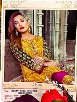
DS-173 Pop: HEAVY ZULI ORNAMA EMBROIDERY Material: Pure Silk Buttons: 20 Type: Party