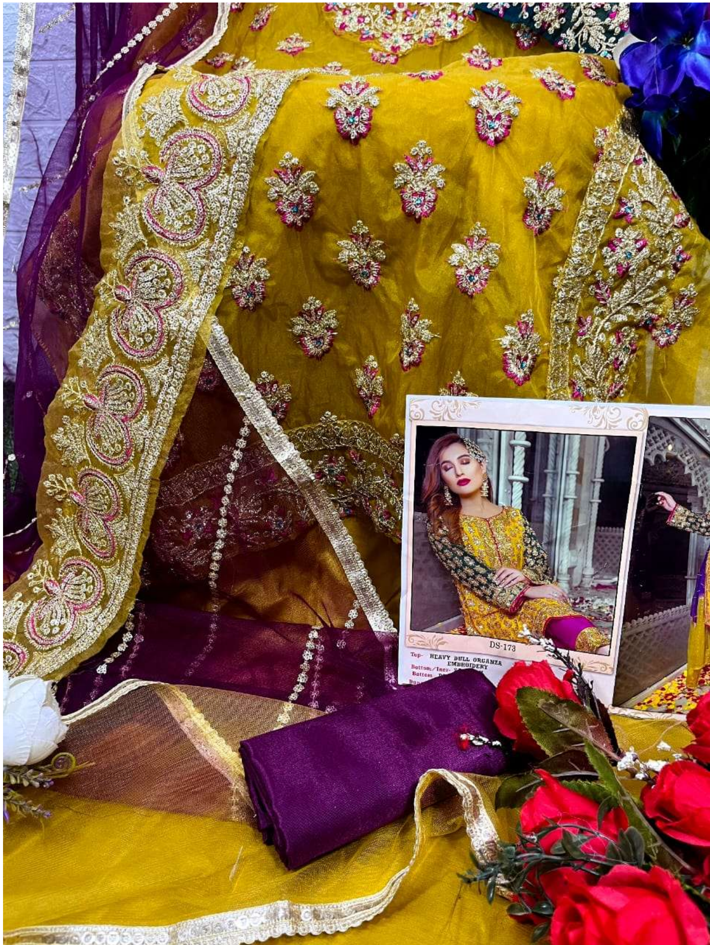
DS-173 Top- HEAVY BULL ORGANZA EMBROIDERY Bottom/Ince-... Bottom-...