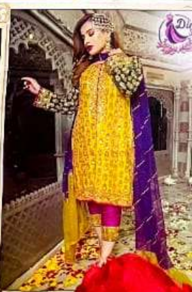
DS-173 Pop: HEAVY ZULI ORNAMA EMBROIDERY Material: Pure Silk Buttons: 20 Length: 1.5m