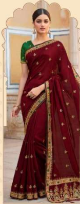
• 2308 •