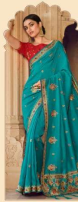
• 2309 •