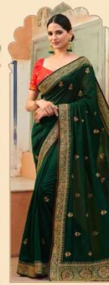
• 2311 •