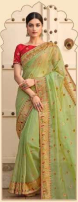
• 2301 •