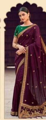
• 2312 •