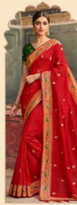
• 2310 •