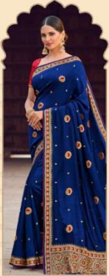
• 2305 •