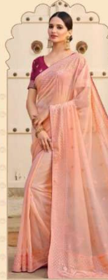
• 2311 •