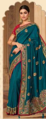
• 2313 •