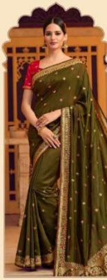
• 2303 •