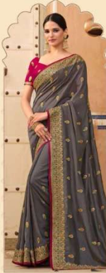
• 2307 •