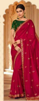
• 2315 •