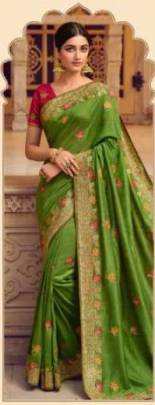
• 2302 •