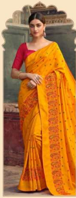
• 2304 •