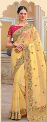
• 2306 •