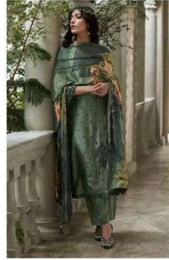
D NO: 9481