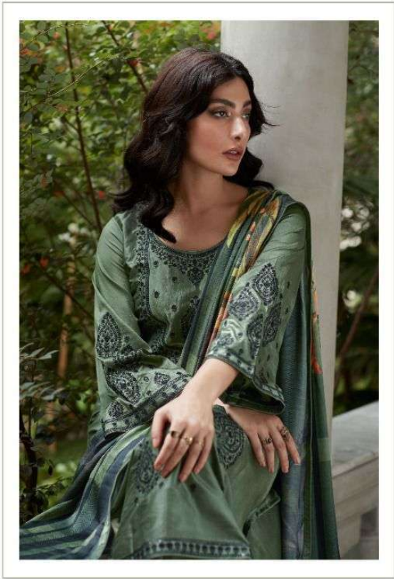
D NO: 9481