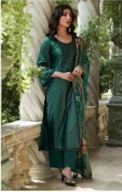
D NO: 9477