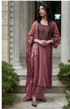
D NO: 9480