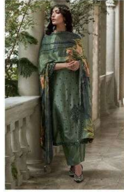
D NO: 9481