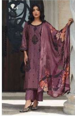
D NO: 9478