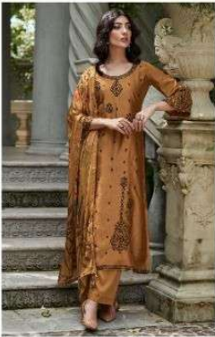
D NO: 9479