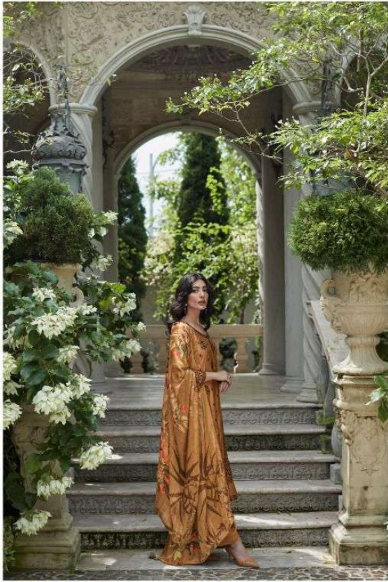
D NO: 9479