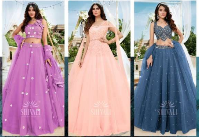
Three more SHOTS 3.0 BLING IT ON 3001

"Fashion is very important. It is life-enhancing and, like everything that gives pleasure, it is worth doing well."