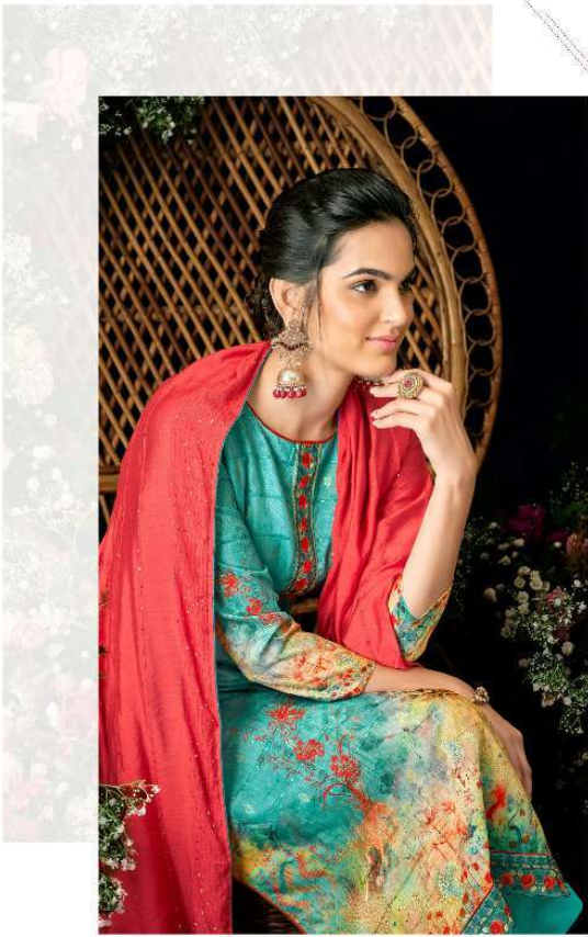
Classic Guffis with a hint of intricate detailing, subtle sheen, rich texture is perfectly wrapped in patache giving style a new meaning and refresh your wardrobe to Indian culture.