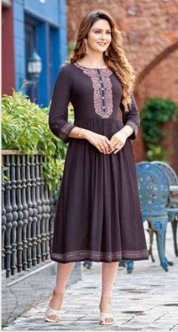
d.no : 1007