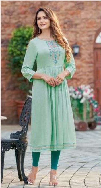
d.no : 1010