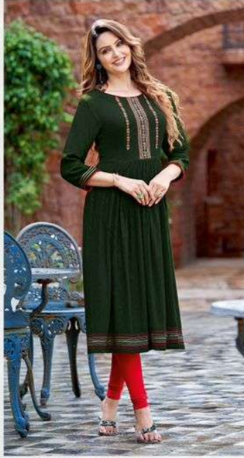
d.no : 1008