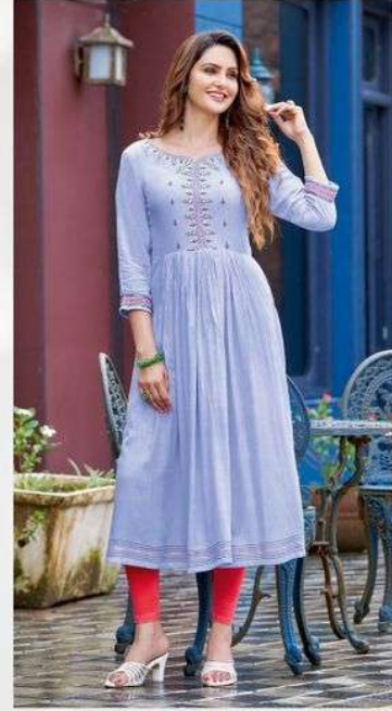
d.no : 1009