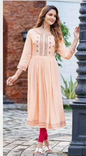
d.no : 1012