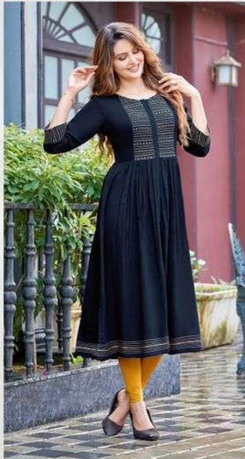
d.no : 1011