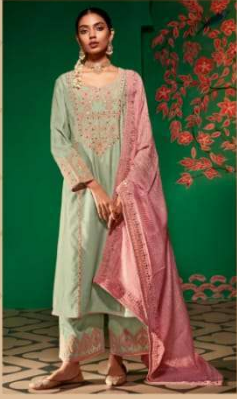
• 2071 •