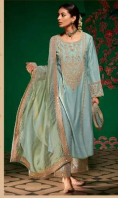
• 2074 •