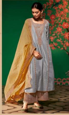
• 2072 •