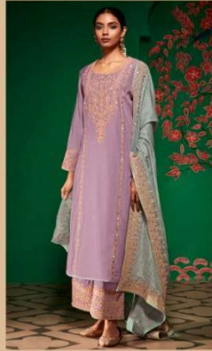
• 2076 •