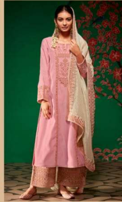
• 2078 •