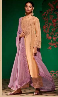
• 2073 •