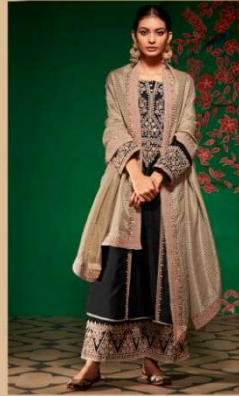
• 2077 •