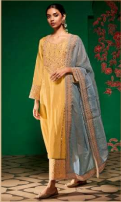
• 2075 •