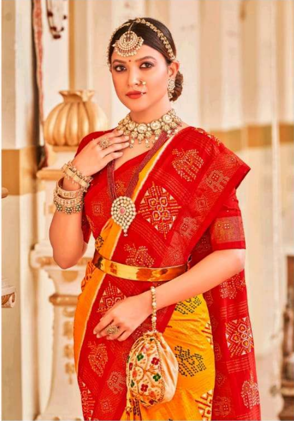
yes, elegance and style is always an integrated part of village attire, and when you adopt such style, you feel a sense of elegance and spirit of look.