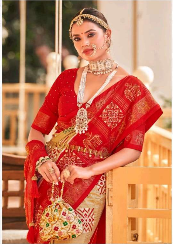
yes, elegance and style is always an integrated part of village attire, and when you adopt such style, you feel a sense of elegance and spirit of look.