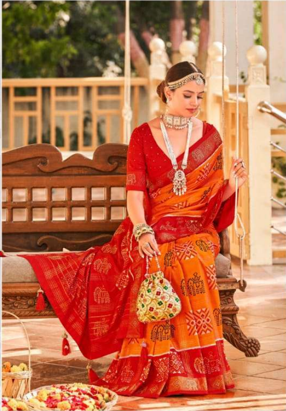
yes, elegance and style is always an integrated part of village attire, and when you adopt such style, you feel a sense of elegance and spirit of look.