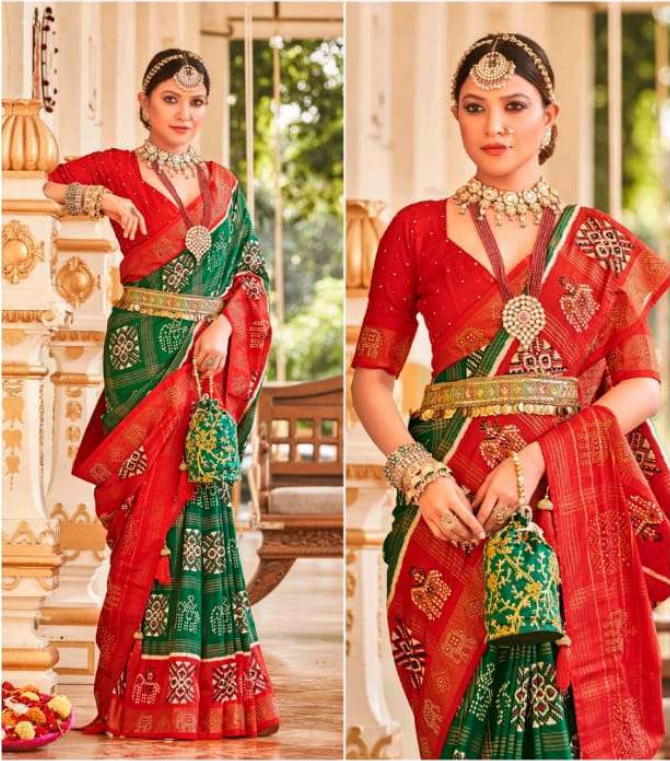
This season marked with swathes of rouge and brilliant blues, fresh new cuts and stunning texture make personal style statement let your clothes complement your style and personality