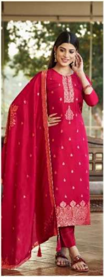
+ 332-001 +