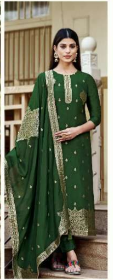
+ 332-006 +