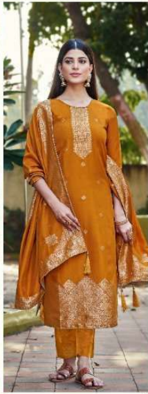
+ 332-003 +