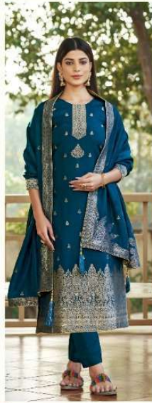
+ 332-004 +