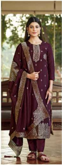
+ 332-002 +