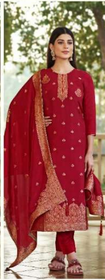
+ 332-005 +