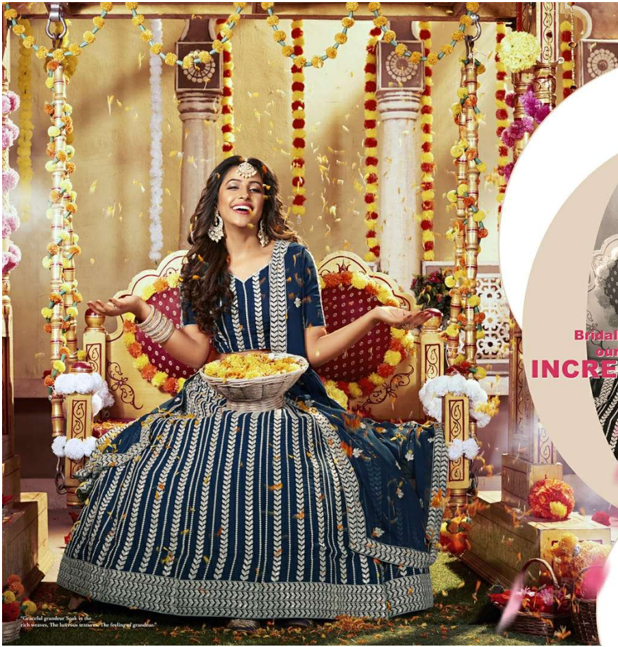
"Gracious grandeur" Spun in the rich weaves. The fashion recreates the feeling of grandeur.