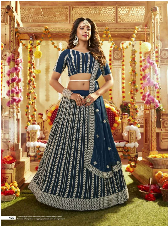
120 "Featuring all-over embroidery and dream-worthy details, here's a Lehenga that is rapping our minds like a rock star!"

Wispy Wonders: Classics with a contemporary twist are always top picks!