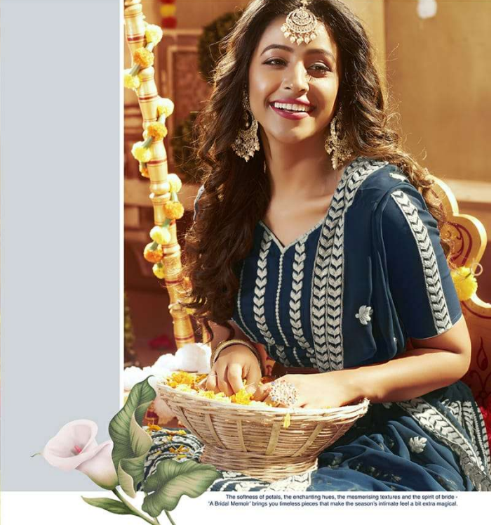
The softness of petals, the enchanting hues, the mesmerising textures and the spirit of bride - 'A Bride's Moment' brings you timeless pieces that make the season's intimates feel a bit extra magical.