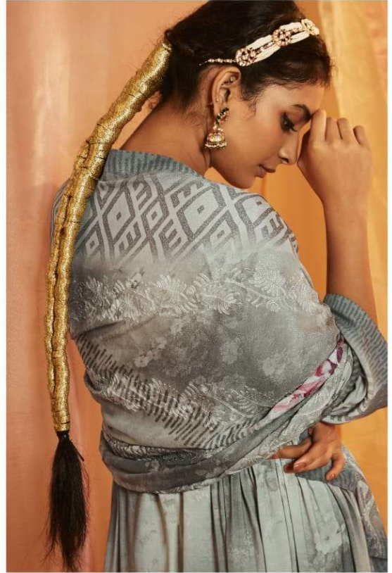
FESTIVE COLLECTION 2022-2023 8868