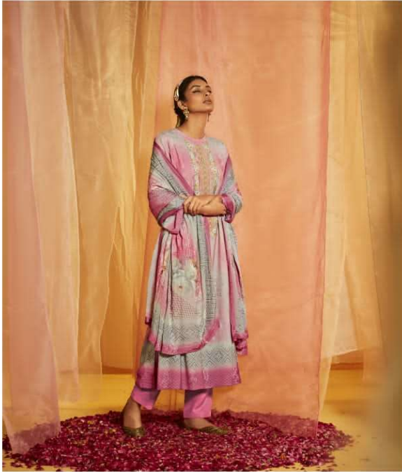
8865 FESTIVE COLLECTION 2022 2023