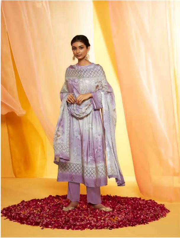
8861 FESTIVE COLLECTION 2022 2023