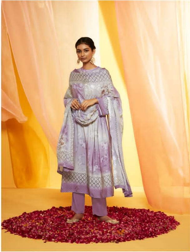
8861 FESTIVE COLLECTION 2022 2023