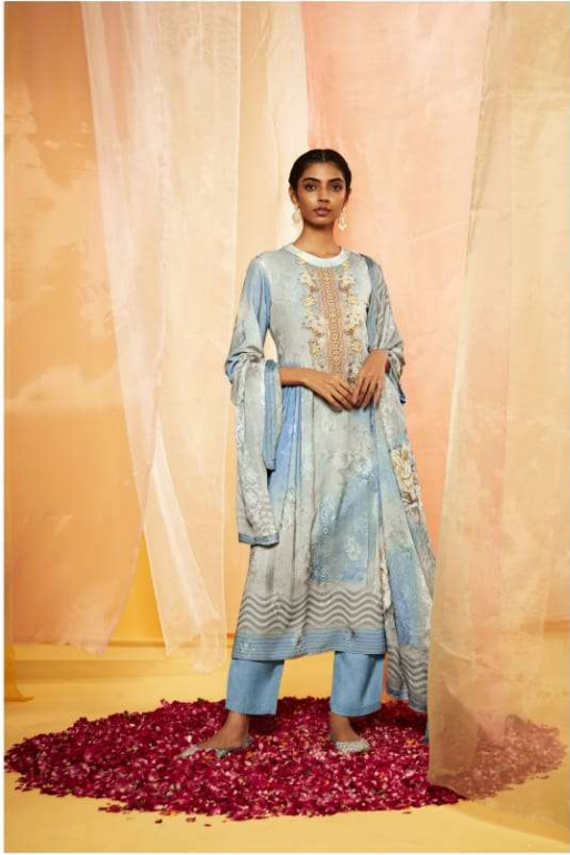
8866 FESTIVE COLLECTION 2022 2023