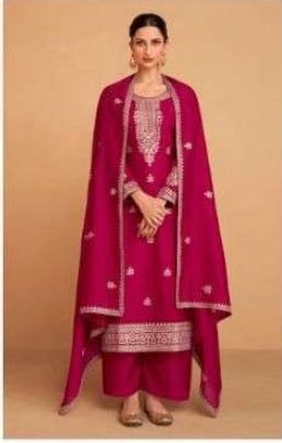
• 9433 •