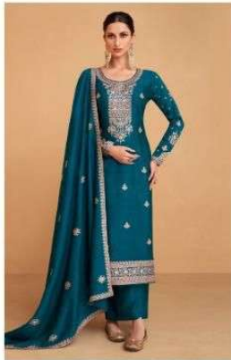
• 9436 •