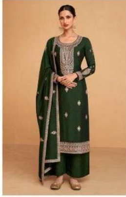
• 9434 •