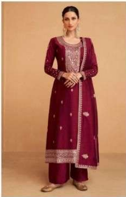
• 9435 •