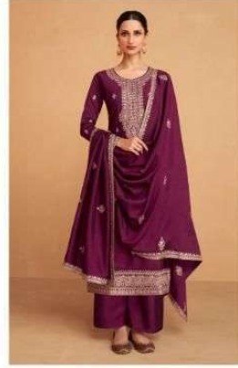
• 9437 •