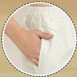
Single Side Pocket