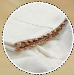
Zig Zag Gota Work